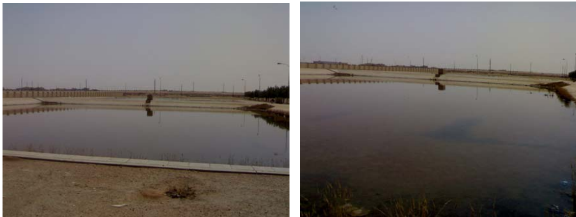
Figure no.9: Areas dedicated for impure water (a) and (b)

The eighth stage is where the impure water will be stored and settle in wide open areas.