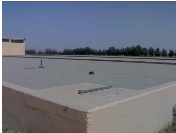
Figure no.1: Tanks (no.1).

The First stage are the storage tanks (no.1) Fig 1. They are two huge underground tanks that receive and store the incoming water. Their area is approx 30m*90m.