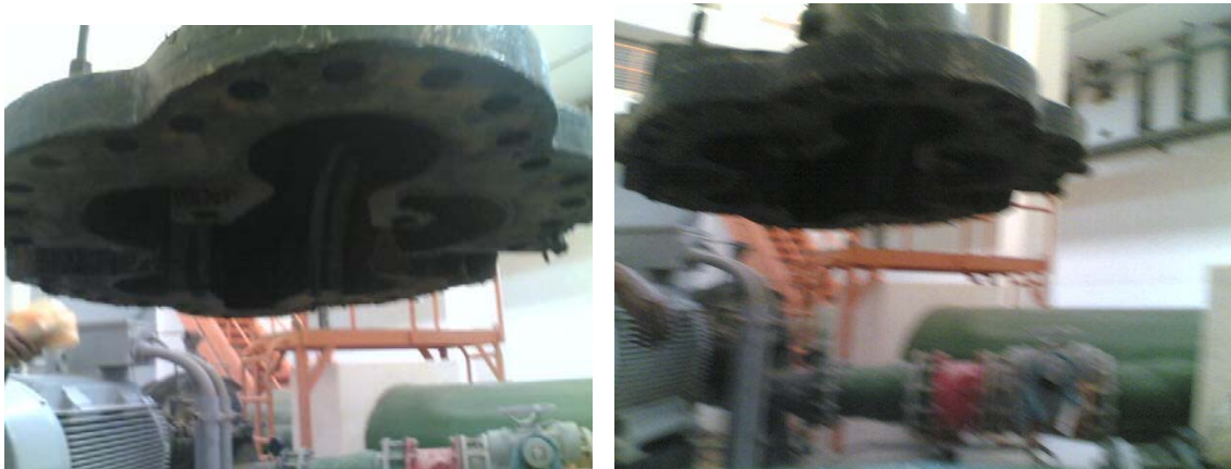
Figure 11: Removing the pump cover (a) and (b)