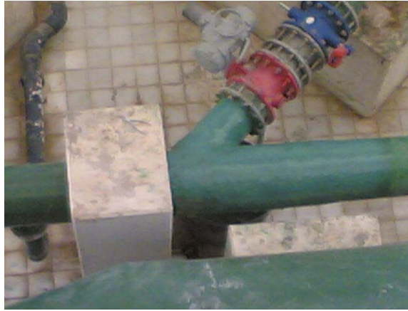
Figure no.2: Group of pumps in pump station no.1