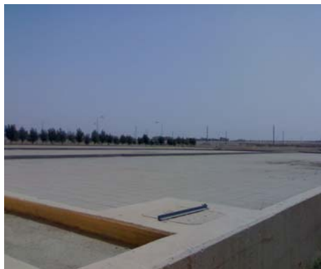
Figure no.7: Tank (no. 2)

The Sixth position is tanks (no.2) Fig7. In this stage the water that is pumped from the filters will be stored there. Afterwards it will be pumped through pipes to reach the pump station (no.2).