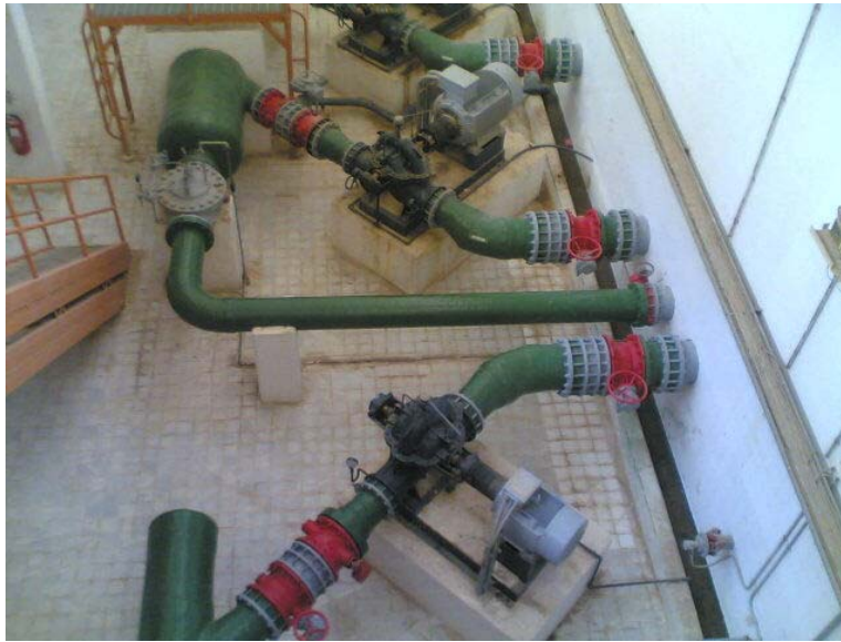
Figure no.8: group of pumps in Pump Station (no. 2)

The Seventh stage is the main pump station (no.2) Fig8. Here all the pure water will be distributed through pipes to Hafer Al-Batin and Al-Qysumah by using powerful pumps.