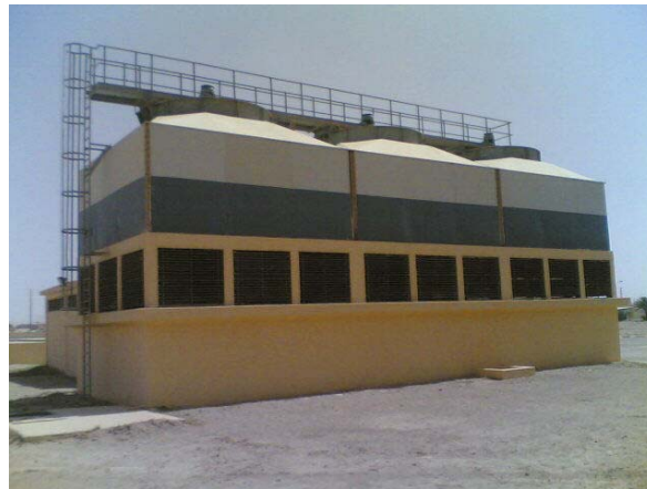
Figure no.4: The cooler station

The third stage is the cooler station. In this position the stored water is passed through the coolers to reduce its temperature. Because this water was coming from under ground with high temperature, so it requires to be cooled, after cooling, it will be moved by the force of gravity through pipes to another place called the clarifier. But the cooler stage in this station is no longer in use.