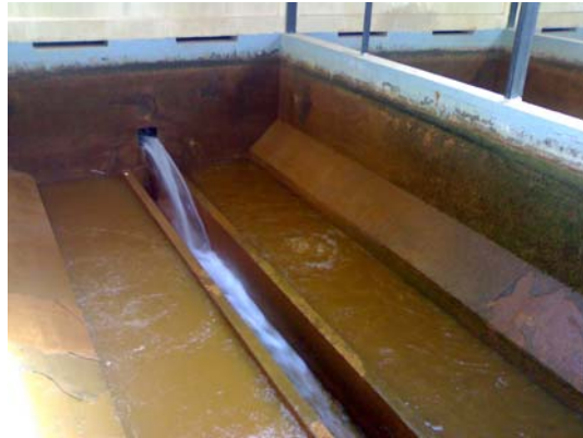
Figure no.6: A Sand Filter in the Sand Filter Station

The Fifth stage is the Sand filter station Fig6. In this stage the chlorine is added to the water, and then the water is treated, filtered and cleaned from dust, rubbish, rocks and germs. And from there depending on the status of the water, it is separated by pumping them through pipes into two other places. One of them is the clean water which will go to tanks (no.2) and stored there. The other one is the dirty water which will go to open areas in a group of lakes and settle there.