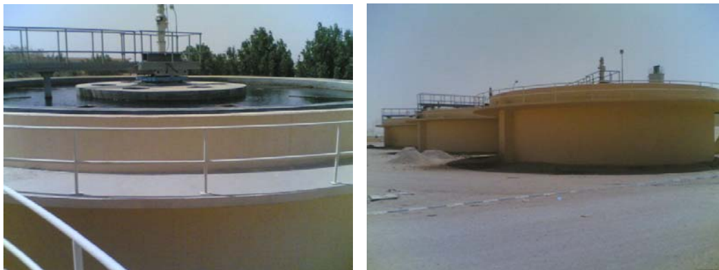
Figure no.5: The clarifiers (a) and (b)

The Fourth stage is the clarifiers Fig5a, b. In this stage the cooled water flows by gravity. The cooled water is mixed with some chemicals called coagulants. Then it is mixed well with a big rotating paddle. Over time the coagulant causes the dirt in the water to settle to the bottom of the clarifier. After that the water flows by gravity to another place called the filters station.